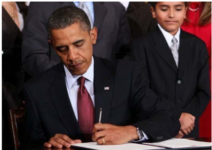
President Obama signs the White House Initiative on Educational Excellence for Hispanics' new executive order in the East Room of the White House, Oct. 19, 2010.

The president's 2012 budget request would increase funding for Head Start and Early Head Start by $866 million for a total of $8.1 billion. The Head Start and Early Head Start programs promote school readiness by enhancing the cognitive and social development of children through the provision of education, health, nutritional, social, and other services to enrolled children and families. At the requested funding level, more than 968,000 children—more than 854,000 in Head Start and 114,000 in Early Head Start—can participate in the program, up from 904,000 in 2009. Thirty-six percent of the nation's Head Start children are Latino, the largest of any minority group in the U.S.