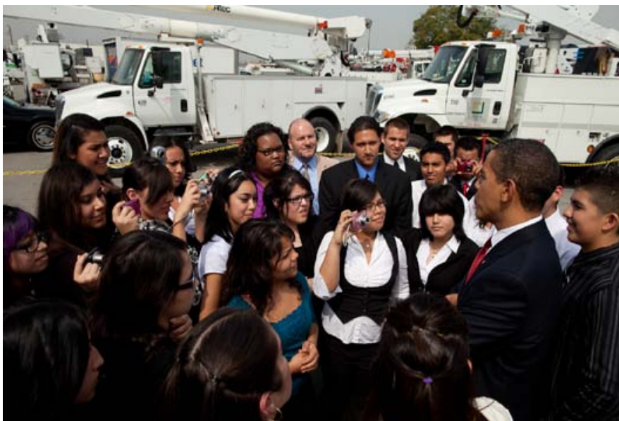
President Obama meets with students he singled out in a speech on education to the U.S. Hispanic Chamber of Commerce, after they submitted a video talking about their families’ economic woes and asked, “Is anybody listening?”

President Obama has requested nearly $123 million in FY 12 for the first year of the First in the World Fund, which would apply the lessons of the successful Investing in Innovation Program to the challenge of improving college completion, particularly for minority and low-income students. First in the World would provide “venture capital” to encourage innovative approaches to improving college completion and increase capacity by: raising productivity and efficiency; providing research support to build the evidence of effectiveness needed to identify successful strategies; and providing resources to scale up and disseminate strategies that are working.