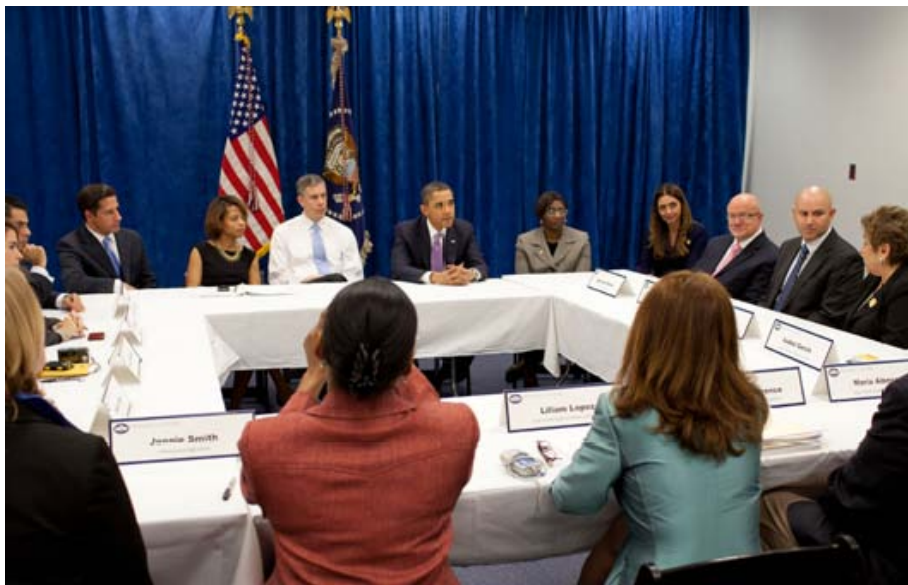
President Obama and Education Secretary Duncan meet with key education leaders in Miami.

Broadly, the Obama administration’s proposal is defined by three words: fair, flexible and focused. It