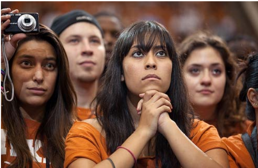
University of Texas at Austin students listen to President Obama speak on education.

The 11 states and one district that have been selected as Race to the Top winners—Tennessee, Delaware, Rhode Island, Florida, Georgia, Hawaii, Maryland, Massachusetts, New York, North Carolina, Ohio and the District of Columbia—reach approximately 22 percent of the nation's Latino student population. Five of the 15 states with the largest Hispanic populations won: Florida (3rd), New York (4th), Georgia (10th), North Carolina (11th) and Massachusetts (15th).