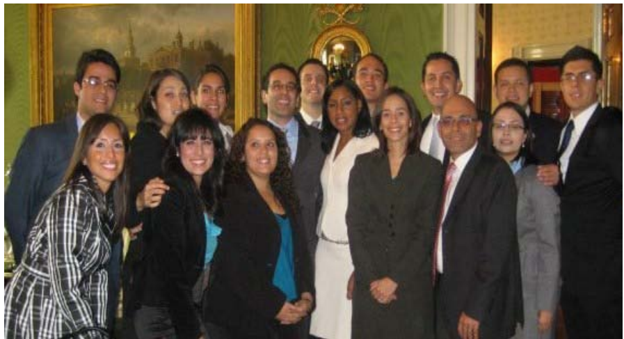
White House Initiative staff and 2009–10 summer interns at the executive order signing ceremony, October 2010.

So in the end, this is about building a brighter future where every child in this country—black, white, Latino,