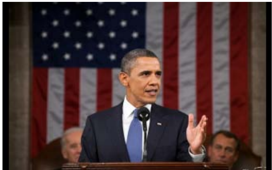
President Obama delivering the State of the Union, January 2011.

In his speech at the U.S. Hispanic Chamber of Commerce conference in March 2009, the president laid out his education agenda and the importance of education to the Latino community, and to all Americans. President Obama called for a focus on early learning, higher standards for student learning, effective teachers and school leaders, and innovation that builds on what works in America's classrooms. Improving education also means providing support to turn around low-performing schools, reducing high school dropout rates and strengthening higher education to increase rates of college attainment and completion so that every student can realize his or her full potential.